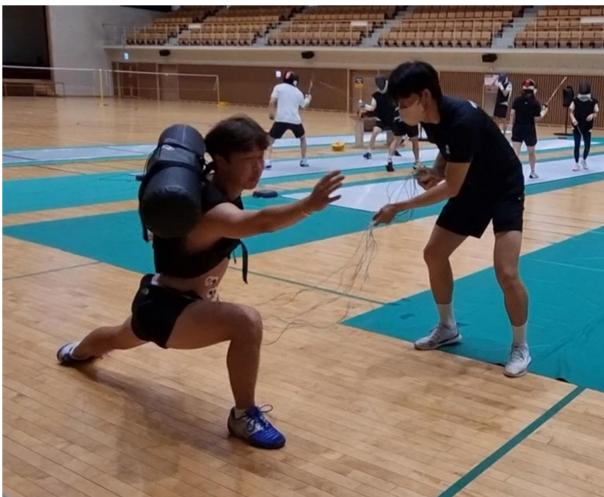
Figure 2. Posture for the measurement of performing fente