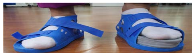
Figure 5. LLD method in standing posture and gait

as shown in Figure 6 (Beattie, Isaacson, Riddle, & Rothstein, 1990). In order to make an accurate measurement of leg length, the patient wore light clothes, and the most pro-