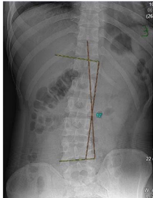
Figure 7. Radiographic view

Cobb's angle was measured as shown in Figures 7 and 8. A line was drawn from the superior endplate of the most tilted vertebra on the upper part of the curvature of interest, and another line was drawn from the inferior endplate of the vertebra at the bottom of the curvature. Drawing perpendiculars from each of these lines, the angle between the two perpendiculars was taken as Cobb's angle (Deacon et al., 1984). With consultation from an orthopedic specialist, measurements were made in the same way for all the subjects by using the superior endplate of T12 and the inferior endplate of L4.