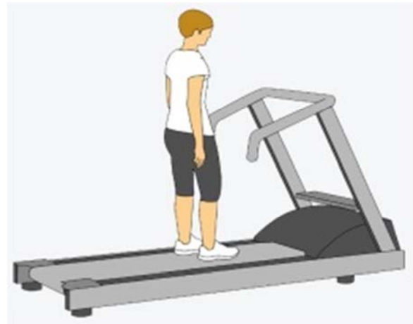
Figure 3. Standing posture measurement

This study measured kinematic parameters in the standing posture and during walking in order to determine how they are affected by LLD. Leg length was first measured by using the TMM from the anterior superior iliac spine to the medial malleolus, with the subject lying on a bed,