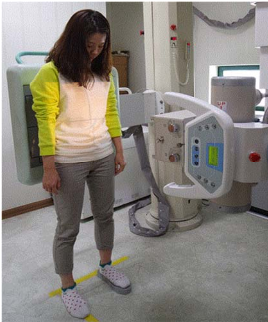
Figure 1. Radiographic image of ascent