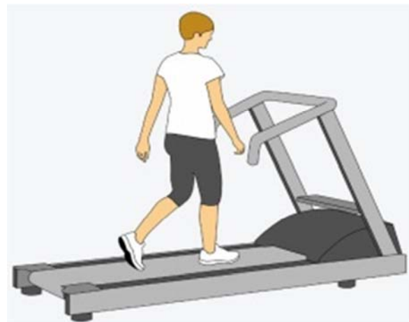
Figure 4. Gait measurement