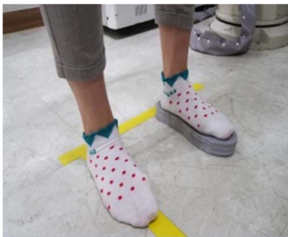
Figure 2. LLD method